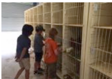
The boys sorting out the chicken's water and food at the evacuation centre at the showgrounds.

What a very emotional couple of weeks it has been. How amazing that we still have our beautiful little school. So many thanks to so many people and groups for their hard work and generosity. I don't think we will forget what happened in the year 2019.