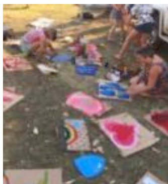
Painting to bring on some rain.

Last week the school was extremely fortunate to have the TAFE not only open its doors to us, but also supply the teachers and students with an amazing array of food. A highlight I am sure for all students was their intensive swim lessons and slide afternoons. It was a delight to see the children grow in their swimming abilities each day.