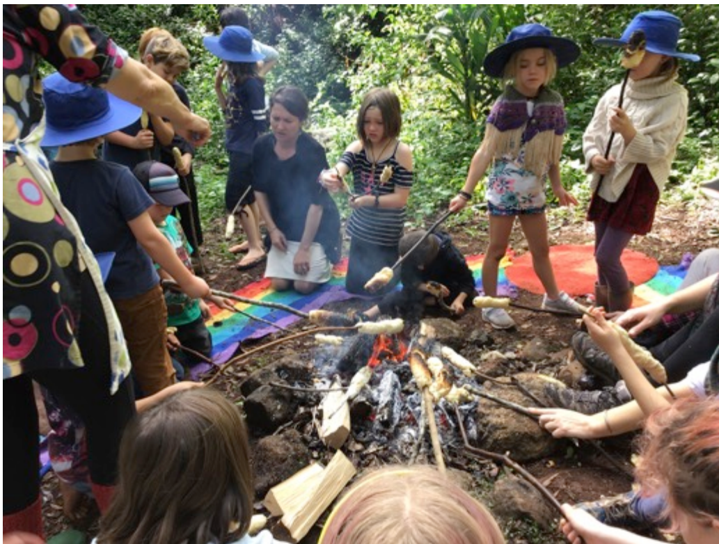
Whole School Damper Cooking