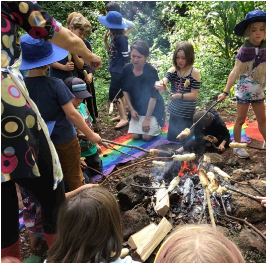
Whole School Damper Cooking