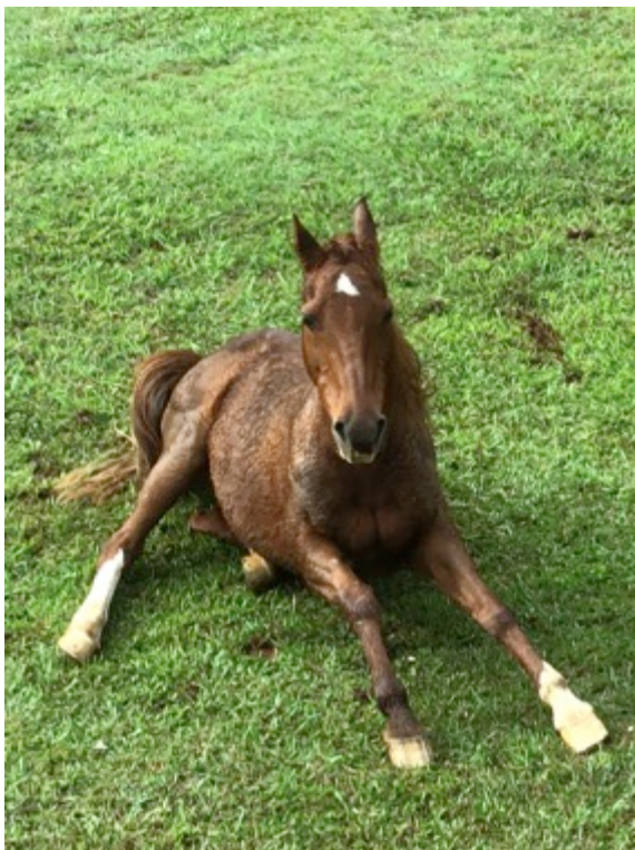
Who is rolling on the grass? 1