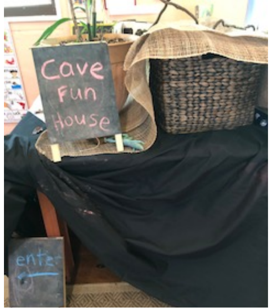
The Kindy's have a Cave Fun House: There are lots of words to discover in the cave...Don't forget your torch!