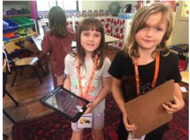
Investigations reporter and photographer.

So far, the kids have shown great interest in exploring the different investigation areas. They have been engaged in their own discoveries and creations and are displaying respect for each other and the parameters set for the Investigations time. The kids have begun writing about their Investigations, and we will build on this as the term progresses.