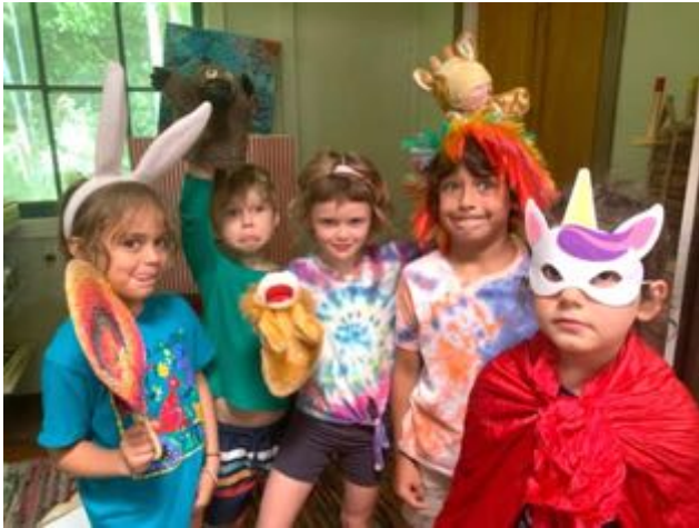
Dress-up and dramatic play.