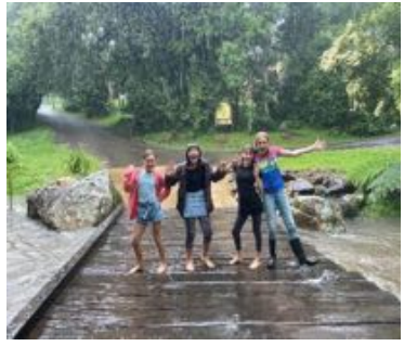
The rising creek and high energy all-round