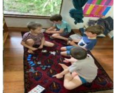
Boys bonding over the building of a motor car.

How can you help? I have created time slots where (only if you feel like coming in) for either reading groups, math games etc - please let me know so I can make a note.