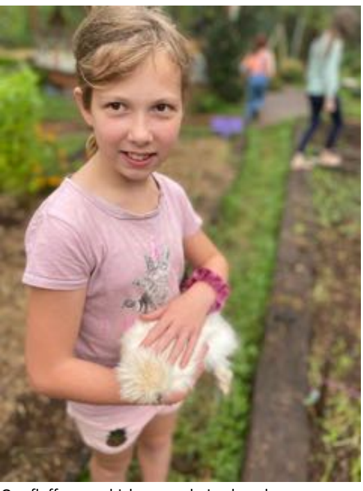
Our fluffy new chickens are being loved up.

I would like to strongly encourage parents, caregivers and extended family members to come along and help with the SEE or STEAM activities. I'll be at school Mondays, Tuesdays and Wednesdays. Everyone has something to offer and if you're not sure please just touch base with me. We can definitely find a way for you to help be part of the wonderful village of people that we need to help our children grow.