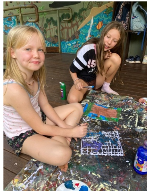
Guruman have been diligently working on their artwork for the upcoming Nimbin Art Fair.