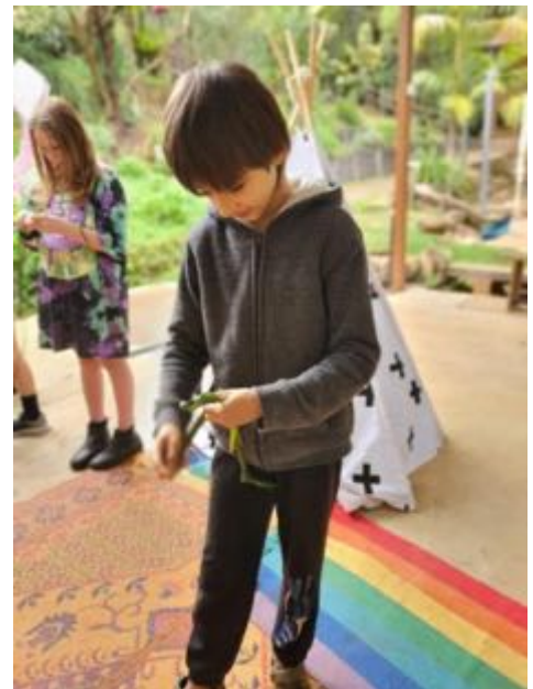
Science Week activity – testing the strength of natural fibers.