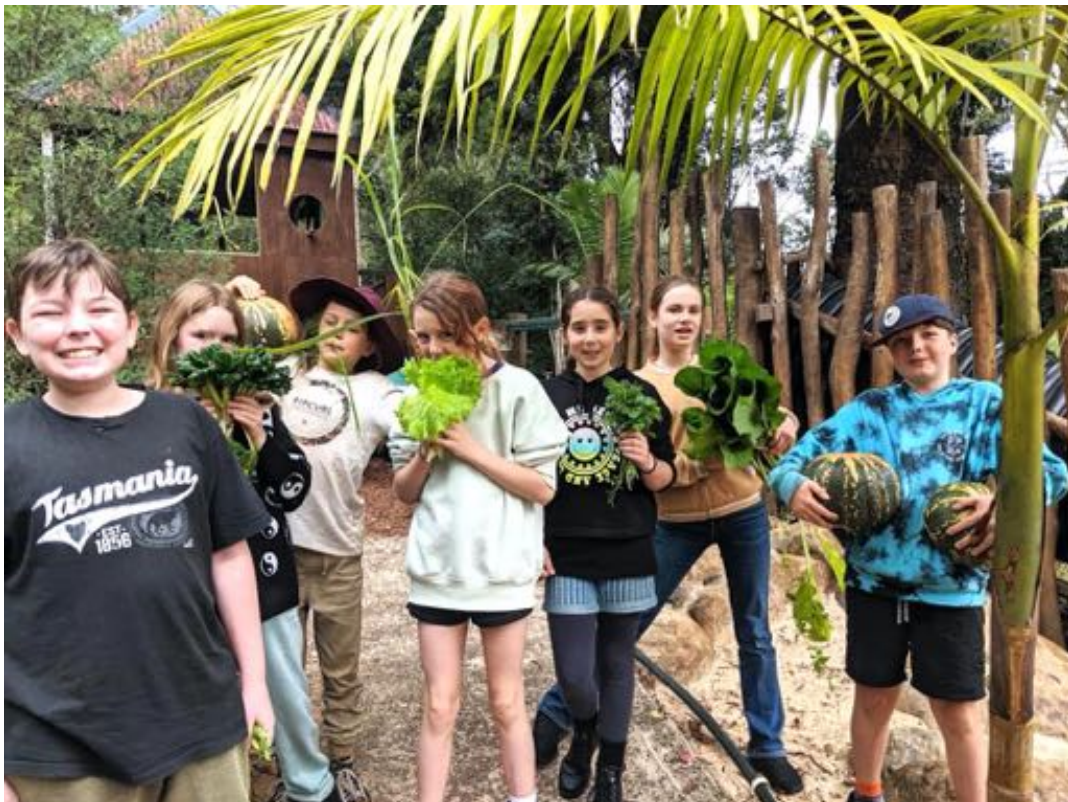
Guruman harvesting garden produce for a delicious pumpkin coconut curry.