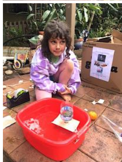
Does it float?