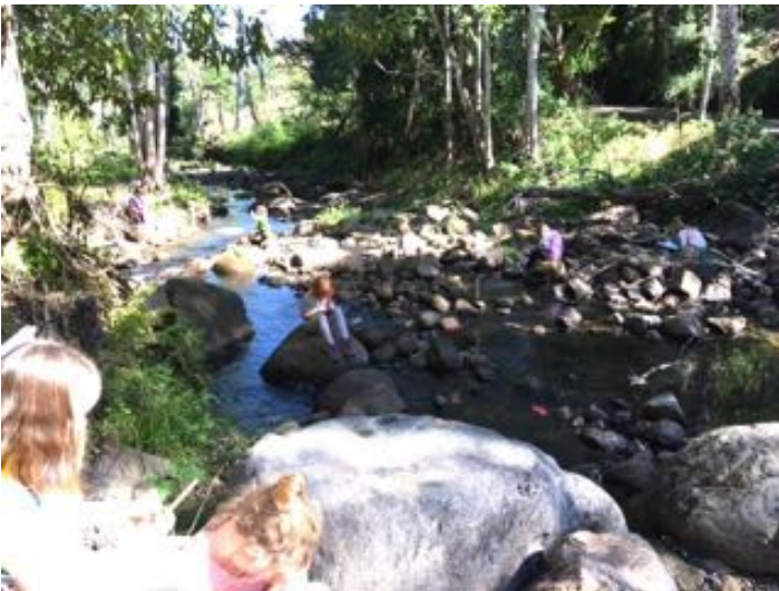
Descriptive writing at the creek