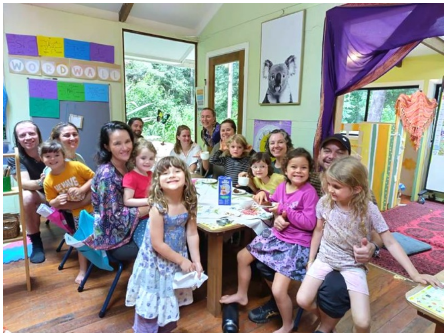
Buribi tea party